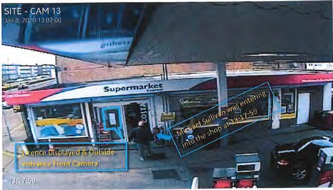
Video footage will be available in the review